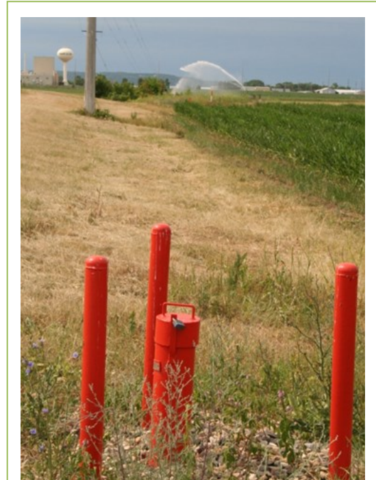
Groundwater monitoring wells near the Village of Prairie du Sac are tested for contamination originating from the Badger Army Ammunition Plant. The Army regularly tests residential wells and one of the Prairie du Sac's municipal wells for the explosive DNT. Irrigations wells are not tested by the Army.

From January 1, 2010 to January 1, 2015, DNT was detected in 462 groundwater samples in Sauk County , according to the Wisconsin Groundwater Retrieval Network. Maximum reported concentrations ranged from 2.2 \mu\text{g/l} to 14,000 \mu\text{g/l} . By comparison, the Wisconsin Groundwater Enforcement Standard for the summed total concentration of all 6 DNT isomers (total DNT) is only 0.05 \mu\text{g/l} . Summary tables for all six DNT isomers are provided as an attachment to this letter.