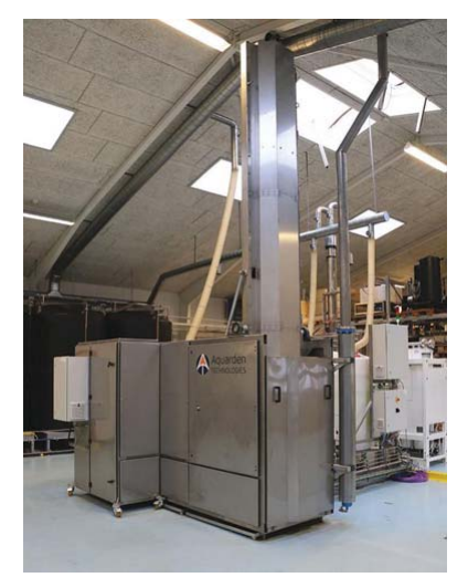
The Aquarden adsorbent process

According to Zhuoyan Cai, Director at Aquarden, conventional technologies, including chemical oxidation, biology, ozonation, and hightemperature incineration, seem inadequate to solve the increasing challenge, leading to the company's development of a sustainable and robust solution using PFAS-selective adsorbents and supercritical water oxidation (SCWO).