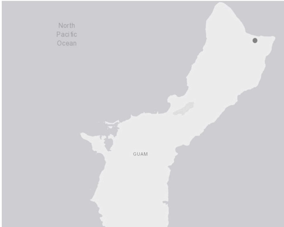
Andersen Air Force Base, Yigo, Guam*